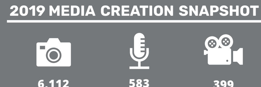
6,112 multimedia kits borrowed

To complement these spaces, we lend high-quality audio and video equipment. The equipment collection, available to all students, staff, and faculty, includes everything from GoPros and lighting kits to professional digital cameras. Plans for the renovated Hillman include expanded spaces and services to accommodate their